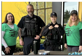
Outdoors for All